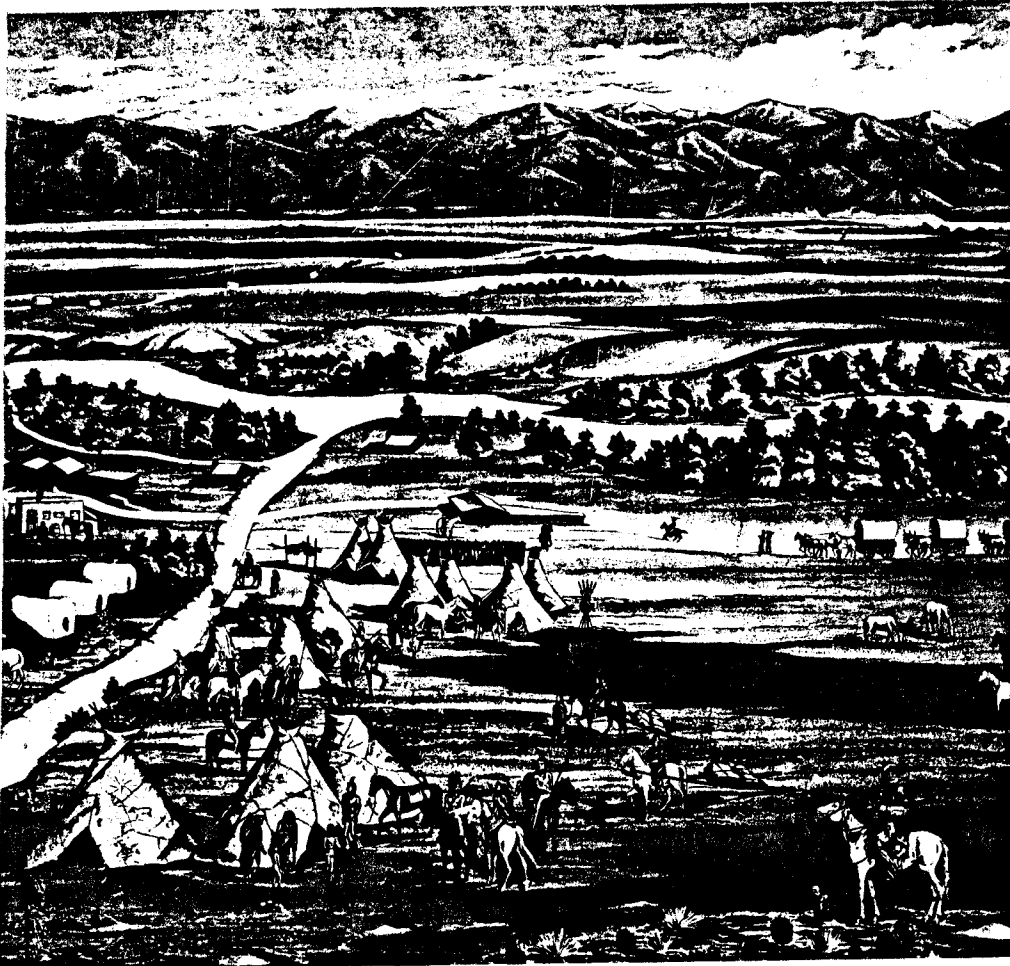
Denver in 1859.

Partners for Livable Places, a national civic organization that was created in 1977 by a number of nonprofit organizations that shared concern in the quality of communities, describes itself as "concerned about all the things that contribute to the livability of a community, with a special interest in the factor that unites them—the sense of community activism and involvement that makes livability possible.... Partners' major goal is to foster civic leadership in communities nationwide, to create the livable communities of tomorrow." Membership is open to nonprofit organizations, municipalities, corporations, foundations, government agencies, and individuals that share this concern. PLP runs a variety of programs, holds conferences and meetings, and publishes a number of periodicals and reports. Individual memberships cost $35 annually and include subscriptions to Place magazine, Livability Digest , and Livability newsletter. To join or obtain more information, write Partners for Livable Places, 1429 21st St., N.W., Washington, D.C. 20036.